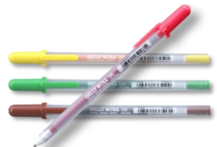
Gelly Roll regular colors