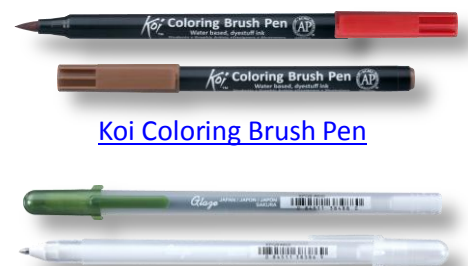
Koi Coloring Brush Pen