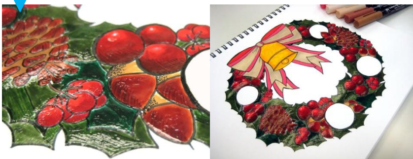
4: Color with Glaze and Koi Coloring Brush Pen. Glaze makes the surface glossy. Over-painting several times with Glaze gives a thicker 3D effect.