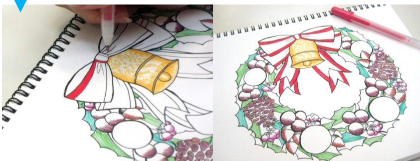
3: Color with Gelly Roll Moonlight for a fluorescent color.