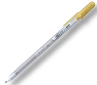
Gelly Roll Metallic