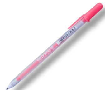
Gelly Roll Moonlight