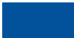
No. 36 Cobalt Blue