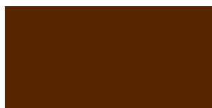
No. 17 Vandyke Brown