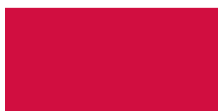
No. 19 Red