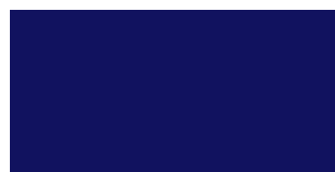
No. 43 Prussian Blue